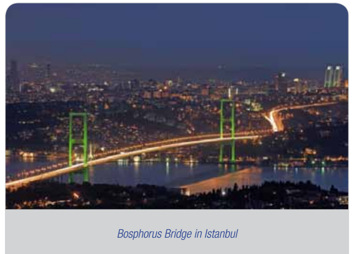
Bosphorus Bridge in Istanbul

We're confident that you'll enjoy the opportunities to network with more than 2,500 HR professionals, trainers, consultants, small-business owners and non-HR leaders from throughout Europe and around the world. Connect with many exhibitors who offer products and services that cater to your HR needs, interact with concurrent session speakers, and glean practical information to enhance your people management practices and improve the success of your business.